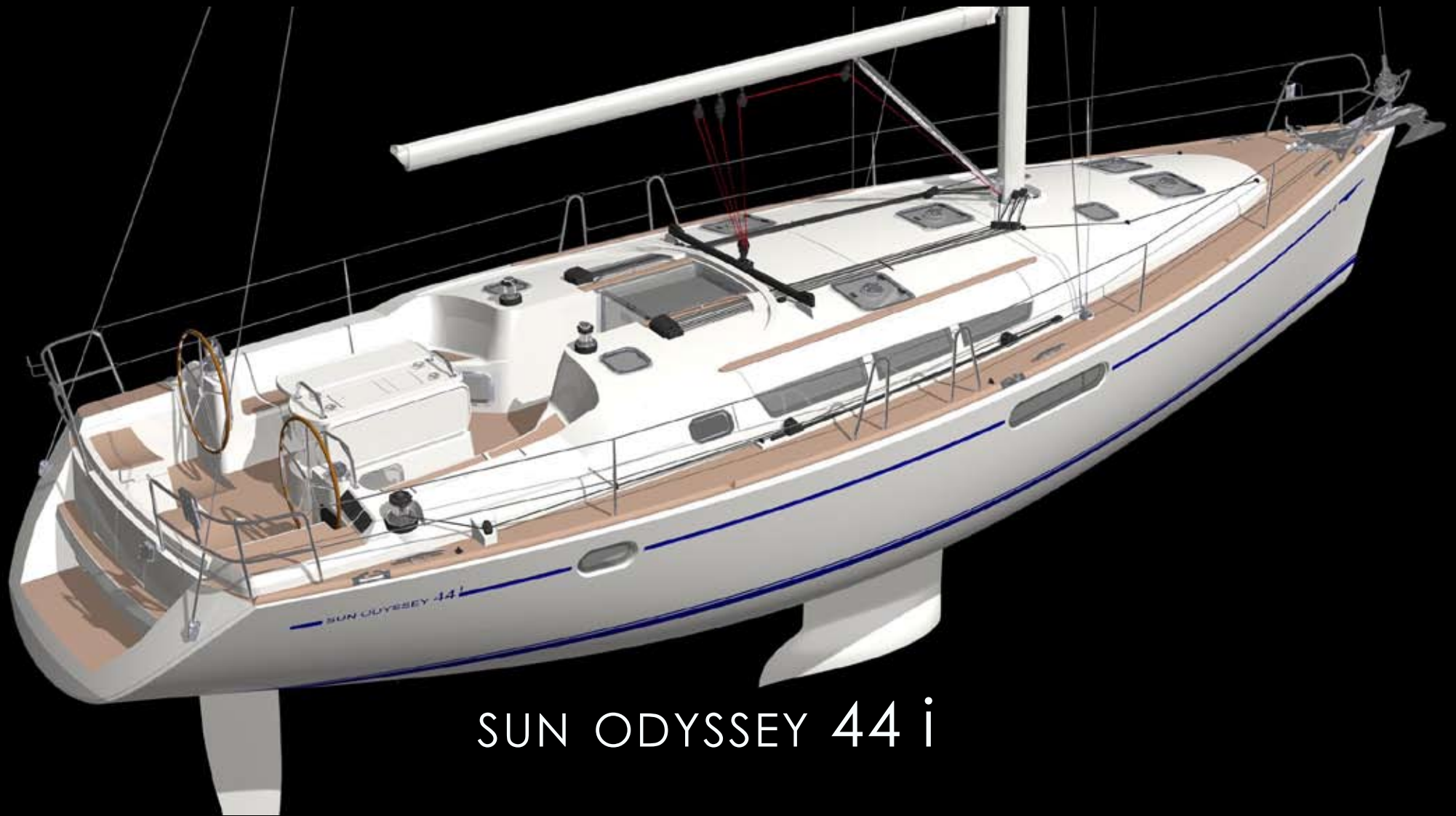
SUN ODYSSEY 44 i