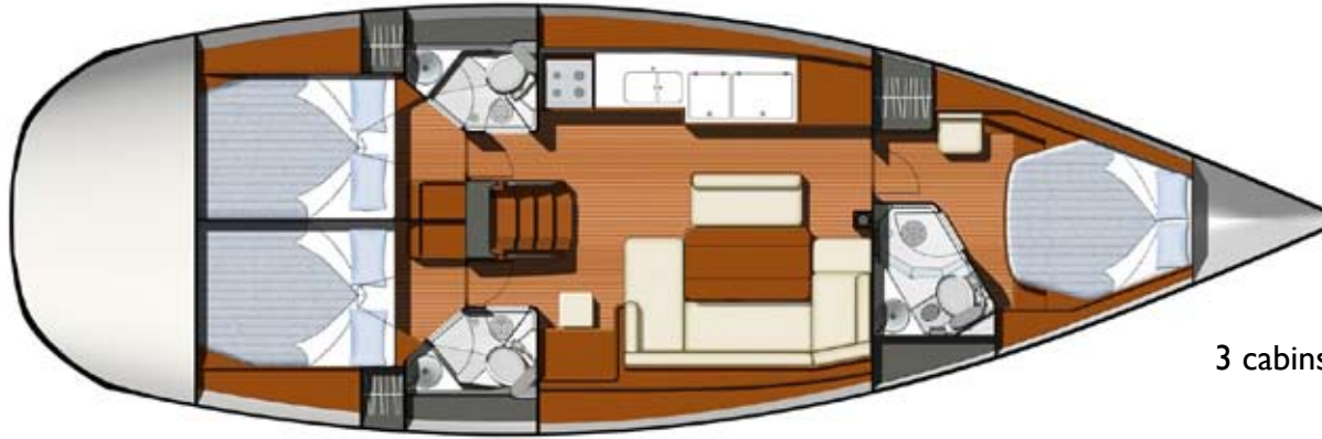
3 cabins version / 3 heads