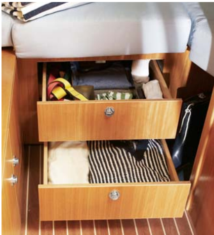
Deep drawers in master cabin offer convenient storage to supplement the large hanging lockers.