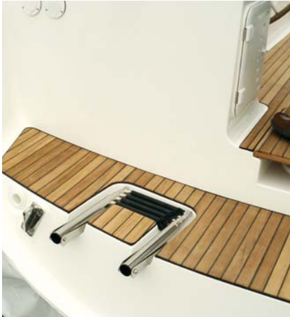
Large teak swim platform features recessed ladder and life raft storage.

With the new 43 Cruiser, Bavaria introduces a rugged sailing performer that you would expect, tempered by a newly styled interior that you would not. The many new features include a front opening refrigerator, microwave, enclosed shatter-proof glass fronted cabinets, newly styled cabinetry and much more. A larger cockpit with a redesigned layout and coamings make sailing the 43 Cruiser even easier to cruise.