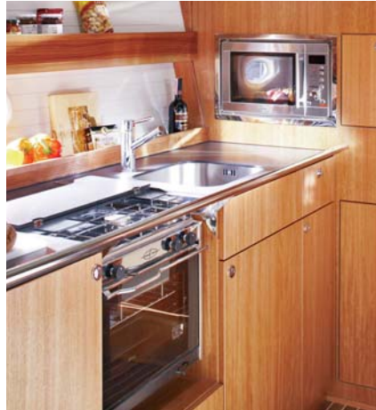
Spacious galley with bulkhead mounted microwave allows easy food preparation.