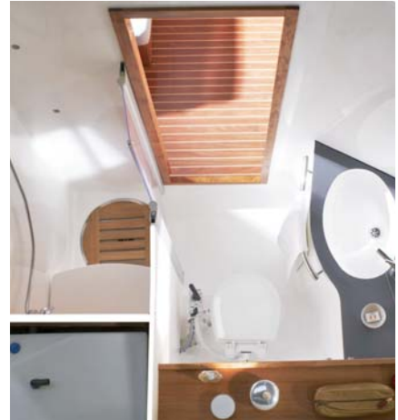
The Bavaria 43 features a stand-alone shower stall with non-skid teak grate.