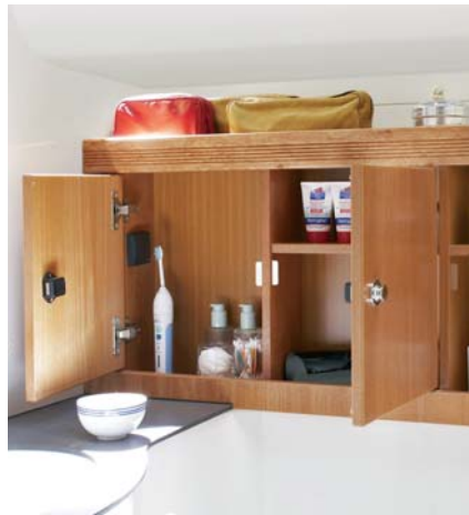
Heads feature rich mahogany cabinets providing aesthetic appeal and ample storage.