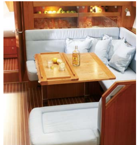
Glass fronted cabinets accent large wrap around dinette.